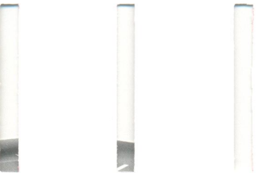
B Possible combination of spacing components and distance values

fields, chose the higher distance indication. Please select only the needed spacing components combination that corresponds with the distance figure (Pic. B). The remaining screws are not needed. Continue with step 3 afterwards.